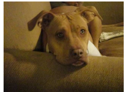
Miles, now named Ditto, cozy in his new home in San Angelo

involved. Miles began his new life with a new name, Ditto, and joined the family’s other pit bull, Booger. Ditto and Booger are always together and can often be found sleeping head to head, offering each other unending comfort and love.